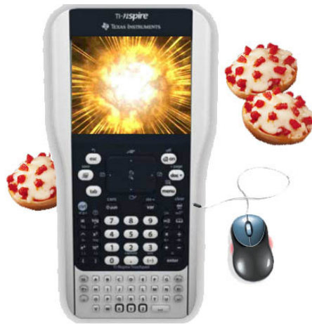
You can also watch porn on it if you hack it.

self-destruct button instead." Are calculators becoming far too advanced for everyday students to handle? One CS major says no. "I love my TI-303. It's convenient for storing all of my textbooks in digital form, looking up things on Wikipedia, and the mini pizza bagel cooker is awesome for when I'm running late to class."