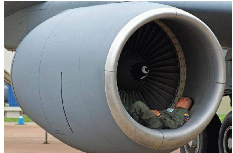
This guy has the right idea. With it running idle, it's probably got airconditioning too...

Where are your favorite napping locations? Let us know at bull@mtu.edu or (801) 200-DEEP.